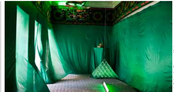
Installation by Slavs and Tatars